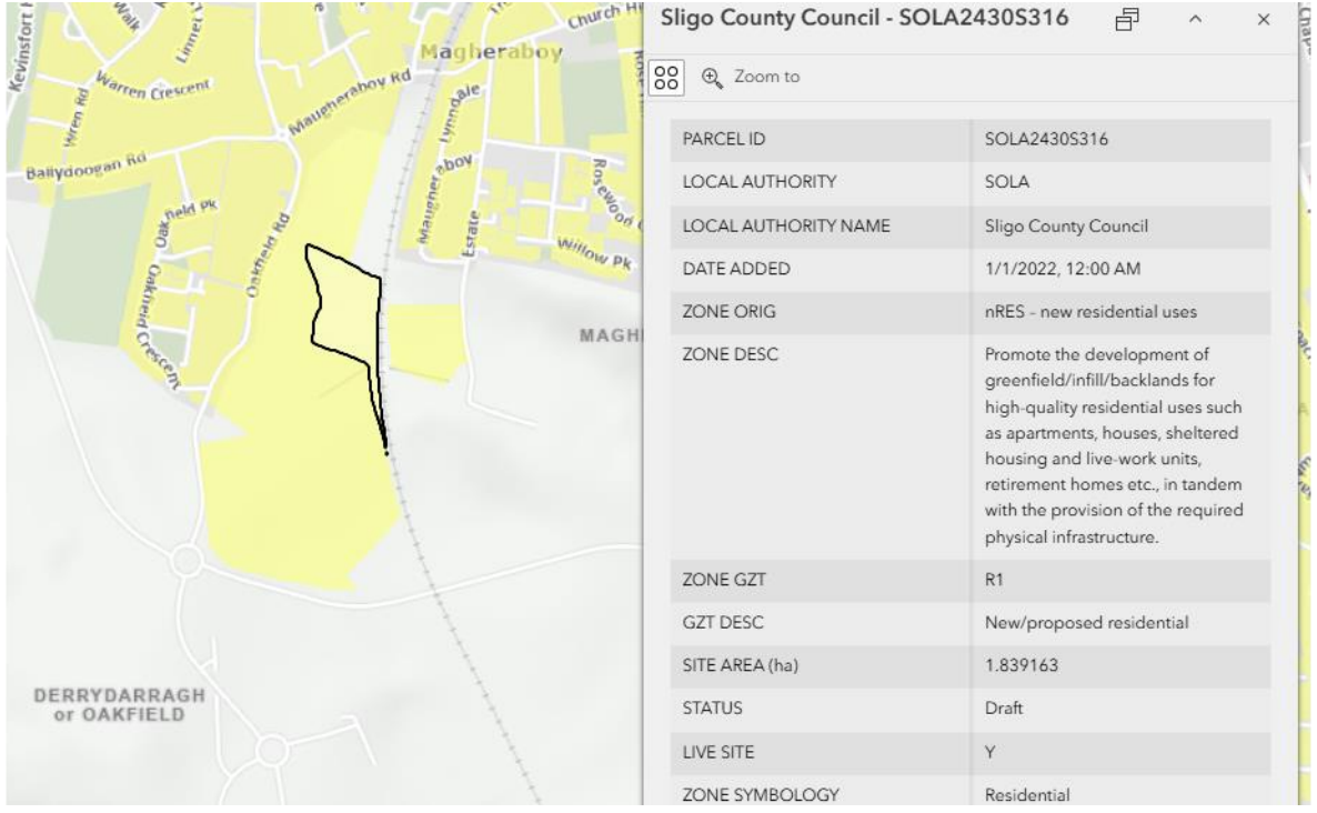
Figure 1 Subject Sites outlined in black, 'in scope' for RZLT.

identified as 'in scope' for the Residential Zoned Land Tax under portions of the Parcel ID no. SOLA2430S316, the land parcel is identified in Figure 1 below.