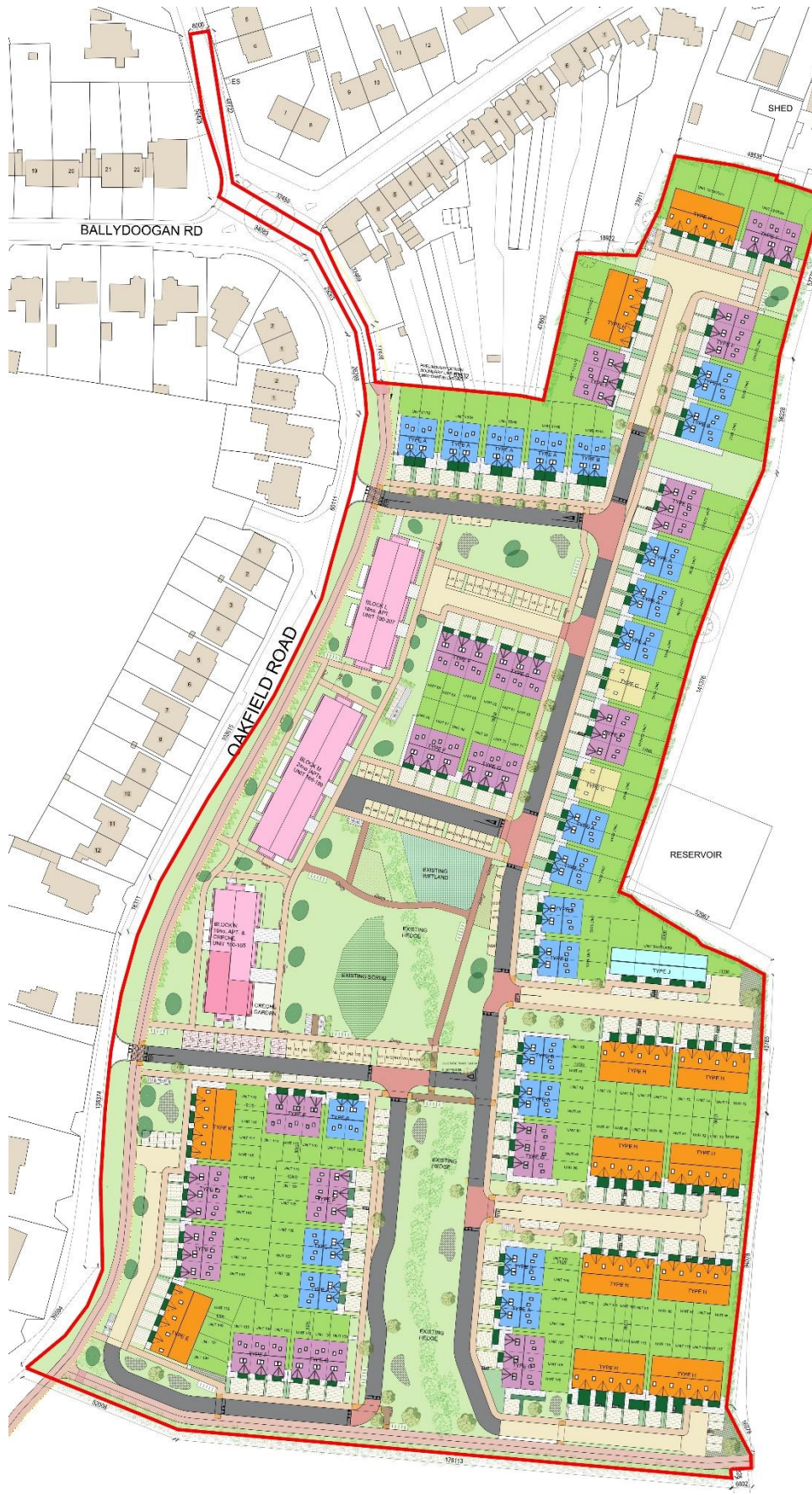
Figure 3 Proposed Oakfield LRD Scheme